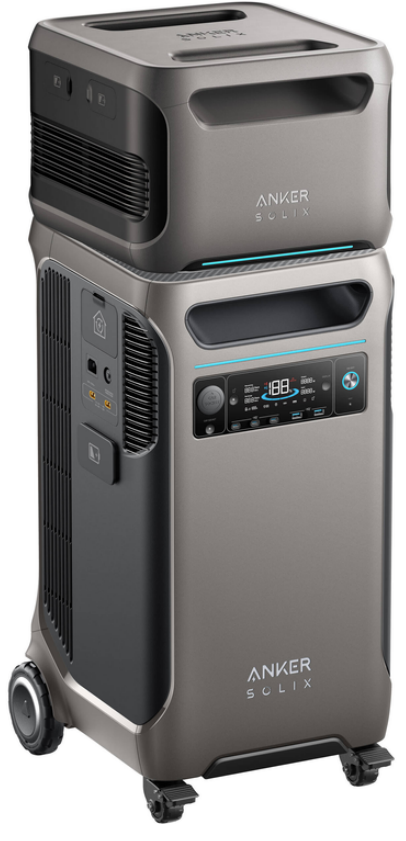
FRONT VIEW (EXPANSION BATTERY ADD-ON)