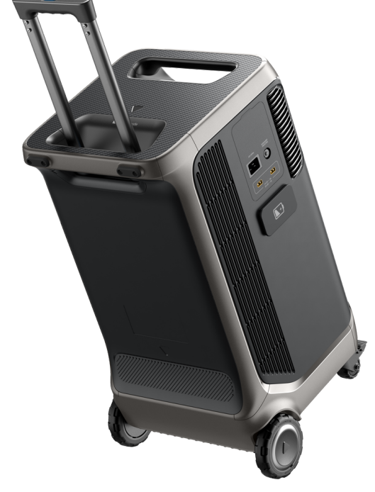
SIDE VIEW (PULL OUT HANDLE FOR TRANSPORTING)